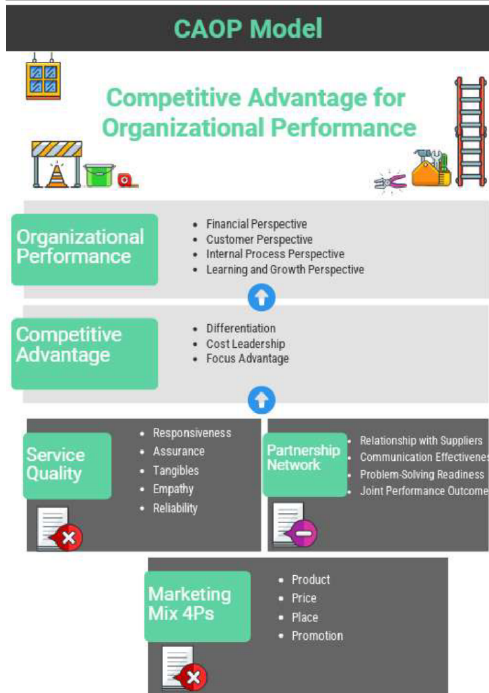
Figure 2 Competitive Advantage for Organizational Performance Model